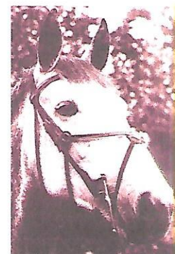
MEXICAN OR HIGH RING GRAKLE

May be used in all Pony Club Activities.